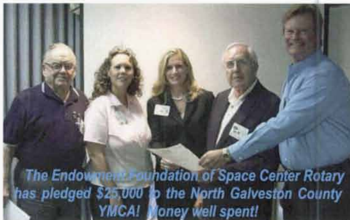
The Endowment Foundation of Space Center Rotary has pledged $25,000 to the North Galveston County YMCA! Money well spent!